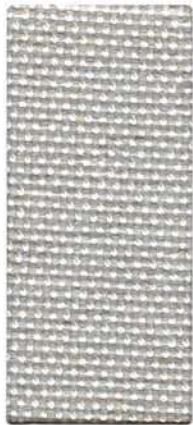
210 Brushed Aluminum