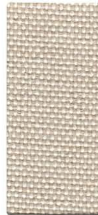
183 Biscuit Beige