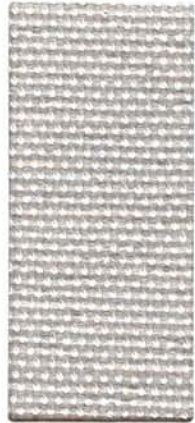
195 Linen Mist